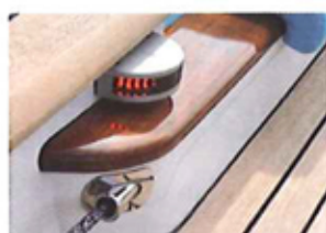
▲ Above: that big bulb should make her stiff. Neat deck detail. Left: smart accommodation. Main picture: huge cockpit with winches set inboard