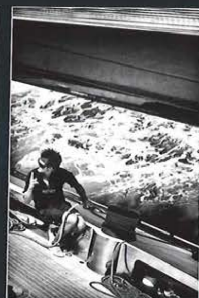
Firefly's owner was instrumental in the design of the yacht's deck layout, which he wanted to be both practical and aesthetically pleasing. She has a yellow cedar deck (above) and all deck gear, winches and custom aluminium fittings are anodised in grey (left and above left). She provided our reporter with a short burst of great upwind sailing (opposite)